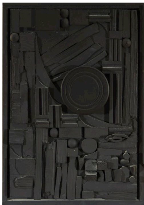
Louise Nevelson (1899-1988), City-Sunscape . Mixed media including resin and wood, 13 x 9 in., signed and dated on plaque: 'Louise Nevelson '79'; numbered: '47/150'; plaque on back: 'For the benefit of the Louise Nevelson Laboratory for Cancer Immunobiology Sloan-Kettering Institute. Copyright, Pace Editions Inc, 1979.' Estimate: $6/9,000