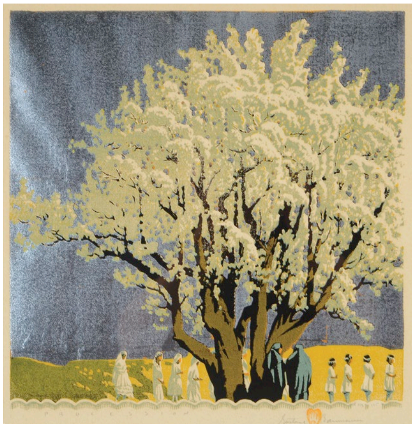
Gustave Baumann (1881-1971), Procession . Color woodblock print with metal leaf, 13 x 12¾ in., chop mark, signed, titled and numbered. Estimate: $8/10,000

Baumann headed to New Mexico in 1918 to visit artist friends in Taos, and while there planned a trip to Santa Fe, where an exhibition of his work was being held at the New Mexico Museum of Art. He fell in love with the town and moved there in 1919 and stayed for the remainder