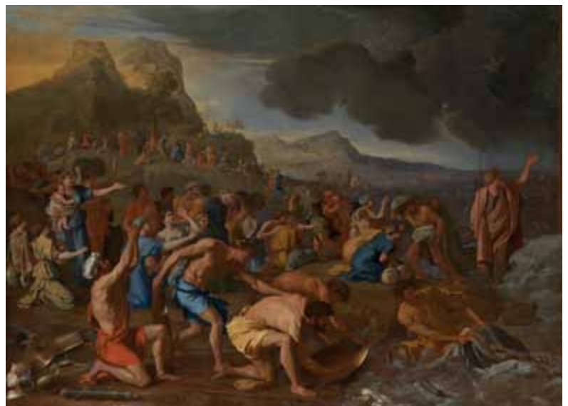
Fig. 1 – Nicolas Poussin, The Crossing of the Red Sea , (1632-34), oil on canvas, 155.6 x 215.3 cm, National Gallery of Victoria, Melbourne, Felton Bequest, 1948 (after the 2011-12 treatment).

Conservator of European paintings before 1800 at the National Gallery of Victoria.