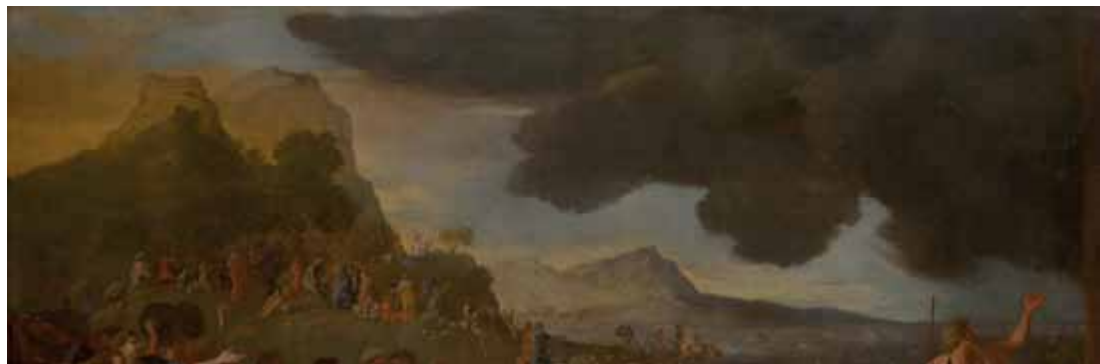
Fig. 21 – (a) Nicolas Poussin, The Crossing of the Red Sea , detail, before conservation treatment, 2011-12. (b) Attributed to Charles Le Brun, The Crossing of the Red Sea (after Poussin). A comparison of the damaged upper half of the Melbourne painting with its Stanford counterpart reveals the loss of critical details of the mountains, landscape and clouds.