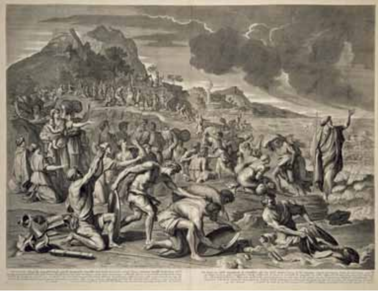
Fig. 17 – Etienne Gantrel (engraver), Passage through the Red Sea , after Nicolas Poussin, engraving, 56.3 x 74.3 cm (image); 63.5 x 82.4 cm (sheet). Research Library, The Getty Institute. The image has been printed in reverse to provide a direct comparison between the painting and the engraving.

undoubtedly far better preserved than Poussin's original, particularly in those areas where Poussin's is so notably worn.