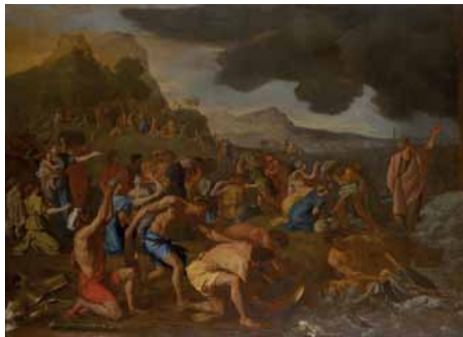
Fig. 2 – The Crossing of the Red Sea before the 2011-12 treatment.

Fig. 3 – Photograph under ultraviolet light before the 2011-12 conservation treatment. The black patches throughout the upper half of the painting reveal the largest areas of retouching left by the previous restorer to mask the abraded original paint surface.