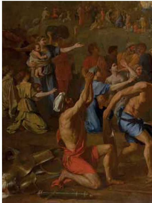
Fig. 20 – (a) Nicolas Poussin, The Crossing of the Red Sea , detail, before conservation treatment, 2011-12. (b) Attributed to Charles Le Brun, The Crossing of the Red Sea (after Poussin). When viewed side by side, a darkening of tone is evident in many areas of the Melbourne painting, particularly in the blue passages. Also notable is a comparative lack of definition in the foreground and landscape.