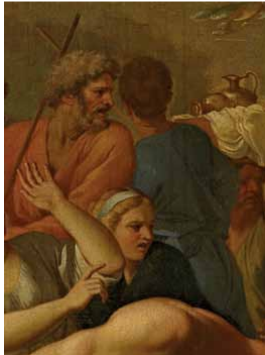
Fig. 22 – (a) Nicolas Poussin, The Crossing of the Red Sea , detail, before conservation treatment, 2011-12. (b) Attributed to Charles Le Brun, The Crossing of the Red Sea (after Poussin). The face of the blue figure in the Melbourne painting was initially thought to be the work of a restorer, but was later shown to be Poussin's first attempt at the figure; he modified it by turning the figure away from the viewer. The original figure resurfaced in the 1947 cleaning of the painting.

'wrong' face was indeed original to the painting. When the paint surface was viewed under stereoscopic magnification it displayed similar characteristics in craquelure and pigment composition to other areas of original paint. So how could it be that other 17 th century copies of the painting contradicted the information on the original? The likely answer is that Poussin initially sketched the figure looking out towards the viewer but for some reason was unhappy with it, so he repainted it, with the new head turned around the other way. In time, probably during the 1947 cleaning, Poussin's revised head was scrubbed off, revealing the earlier version beneath. The reason the earlier head now sat so uncomfortably on the blue-clad body was the result of a modification made by Poussin when he reworked the figure. In order to show the figure turned away, he had to add the right shoulder to what was previously a side-on view of the figure. This modification was now visible as a timentito of darker and thinner paint.