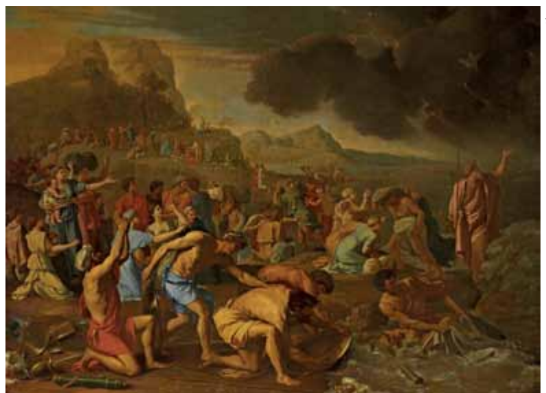
Fig. 19 – Charles Le Brun (attributed to), The Crossing of the Red Sea (after Poussin), oil on canvas, 158.1 x 213.4 cm, Private collection, on loan to The Iris and B. Gerald Cantor Center for Visual Arts, Stanford University, USA.