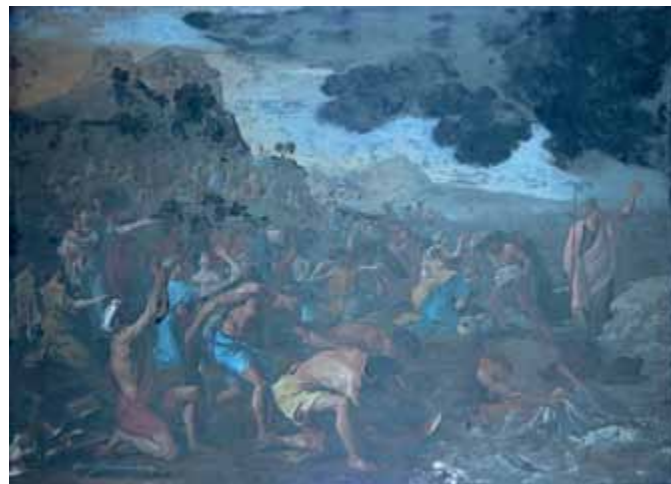
Fig. 3 – Photograph under ultraviolet light before the 2011-12 conservation treatment. The black patches throughout the upper half of the painting reveal the largest areas of retouching left by the previous restorer to mask the abraded original paint surface.

It is also now evident that Poussin very carefully manipulated the play of light on the landscape as well as in the sky to reinforce the sense of depth he created in the composition. The sense of careful gradation of light to create depth was obscured until the recent treatment of the work. Consequently, a discernable sense of unity between land, sea and sky has returned, making it far more visually coherent and appealing.